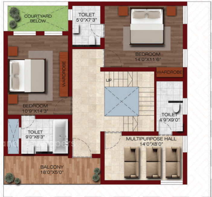
North Facing Ground Floor