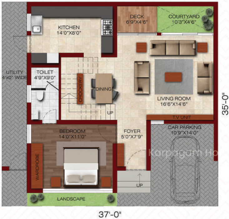
South Facing Ground Floor